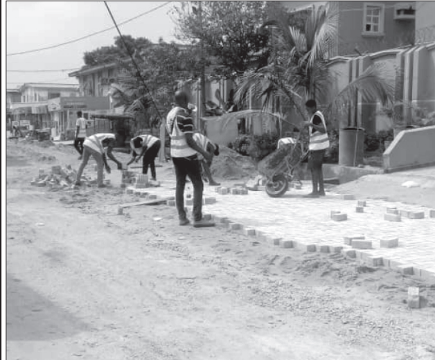
Construction work in progress